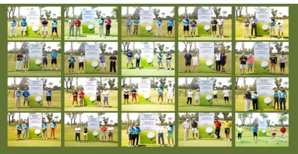
Aerospace Partners Golf Tournament 2021

All net proceeds from the tournament will go towards the Cerebral Palsy Alliance Singapore.