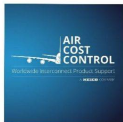
Air Cost Control Pte Ltd